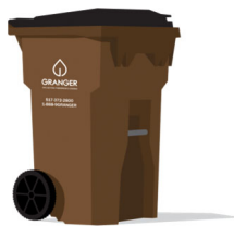
Granger Waste Services