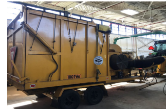
Village of Edmore

piles at least three feet from any poles (mailboxes, utility poles, fire hydrants). They cannot maneuver the hose on the leaf vacuum around these obstacles.