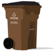
Granger Waste Services

The Village’s semi-annual cleanup is here! This is a bulk trash pickup service offered to the residents of Edmore. Please take this opportunity to go through your property and get things organized by getting rid of those extra bulk items that you may have. Granger will begin picking up at 7:00 a.m. on Saturday, October 12th and will only stop once at each residence. Each residence is allowed to dispose of 9 cubic yards of waste. No tags or mattress bags are required.